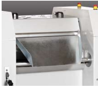
Fig. 5.2: The latest safety regulations for operators are fulfilled