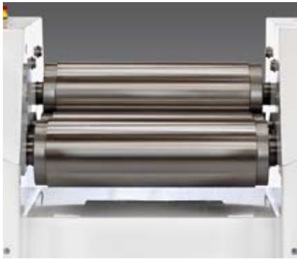
Fig. 5.1: Easy access to the roller compartment for easy cleaning