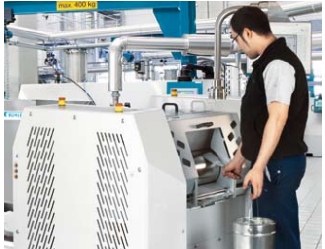
Fig. 4.2: Easy access and high standards regarding operator safety are key elements of Trias® three-roll mills