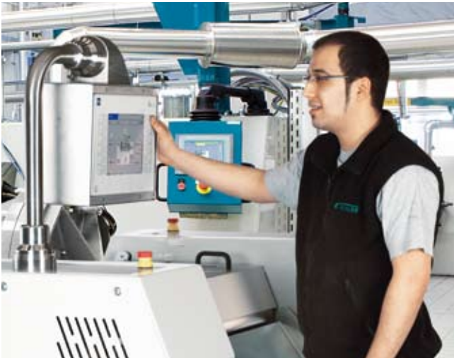
Fig. 4.1: PREMIUM control package with graphic touch screen panel