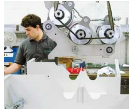
Fig. 5.3: The complete roller package can be exchanged simple and quick

The newly designed roller compartment allows for easy cleaning. The losses during product changes or due to errors are minimal as the process unit only holds a very small amount of product.